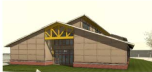
3D VIEW SOUTH ENTRY