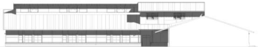
EAST ELEVATION 11.20.14 DWG 104